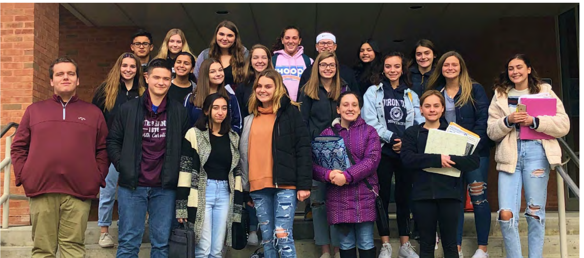
The NLHS Spanish Club and Honors Spanish III class recently went to Slatington Elementary and taught a Spanish lesson to third, fifth, and sixth grades.