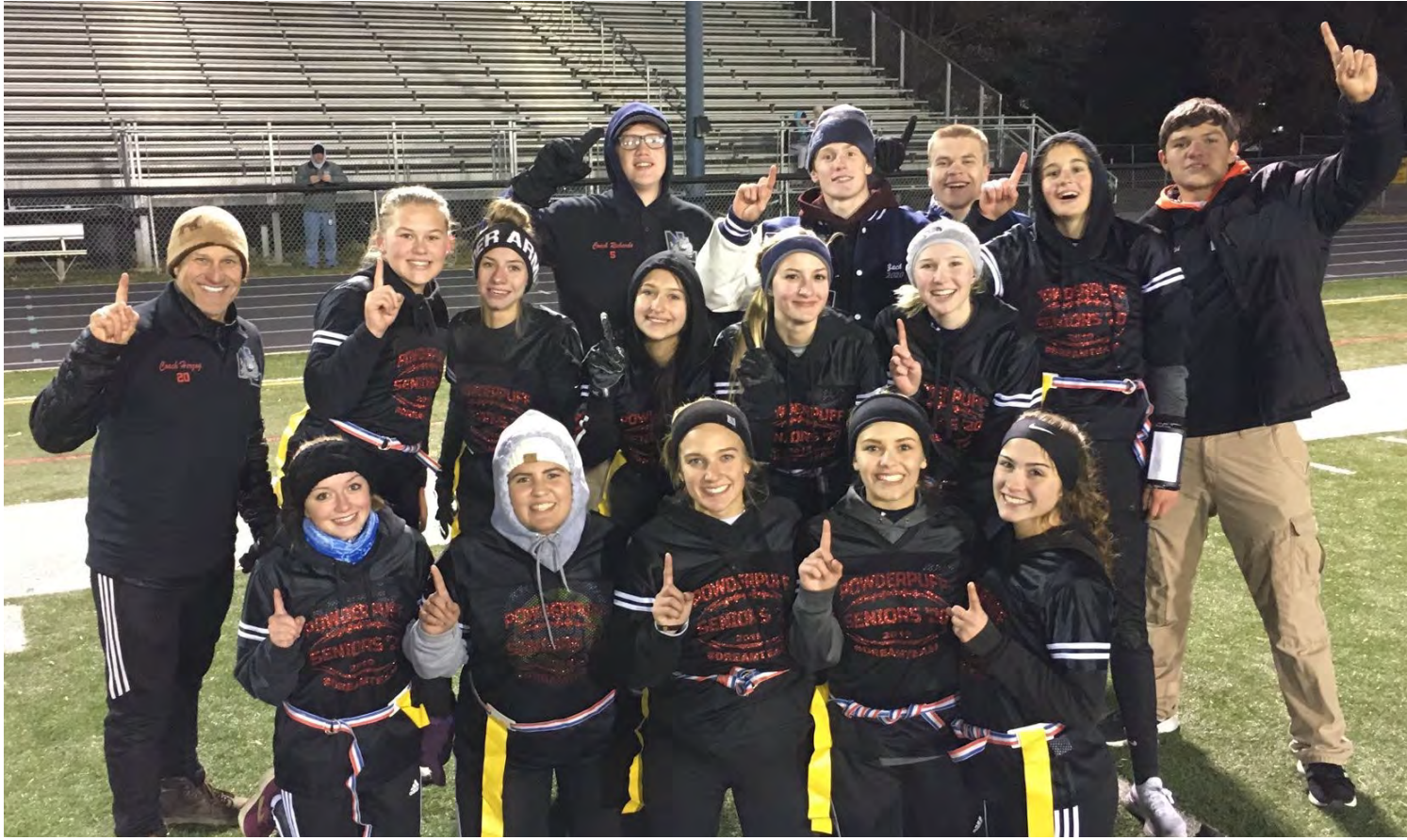
The Seniors were victorious in this year's Powder Puff tournament, held on a colder-than-normal November evening.