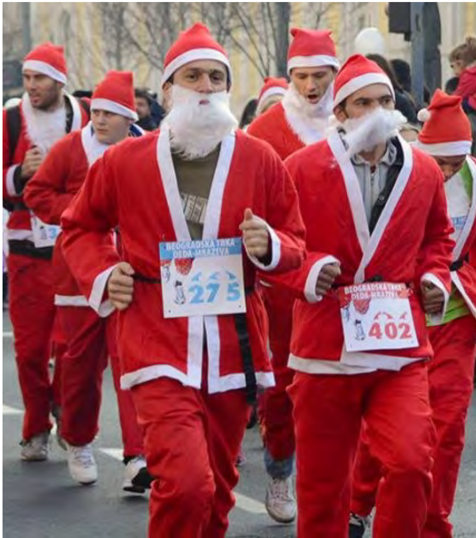
Many communities across the globe hold a "Running of the Santas" race each holiday season.